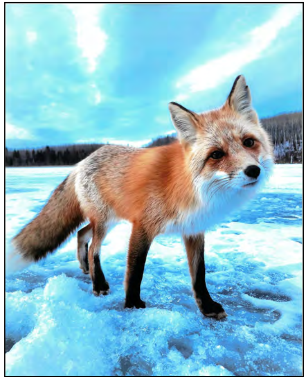
Photo by: Josh Rafuse, Thickwood Hills Wildlife Federation 1st Place Provincial Photo Contest Winner, Wildlife

FOR REGISTRATION FORMS OR MORE INFORMATION VISIT: SWF.SK.CA/PROGRAMS/ CONSERVATION-CAMP/