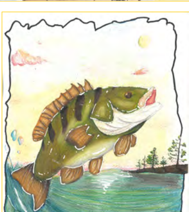
2024 2nd Place Winner - Brynlee from Edam