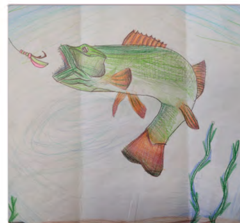
2023 3rd Place Winner - Brinley from Saskatoon

Send original artwork showcasing Saskatchewan fish species, postmarked by April 30, 2024 to: