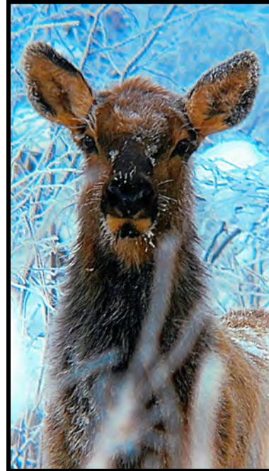
Photo by: Owen Myhr, Preeceville Wildlife Federation 1st Place Winner, 2024 Provincial Photo Contest